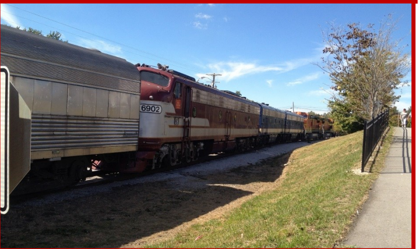
Motive power for the day: 2 B40-8Ws, 2 FB7s, and E8. More pictures next month.