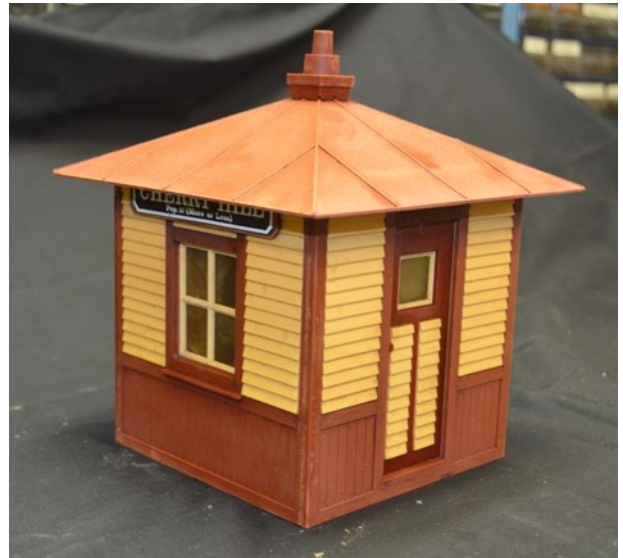
Cherry Hill Station, Pola, good condition, $15.00